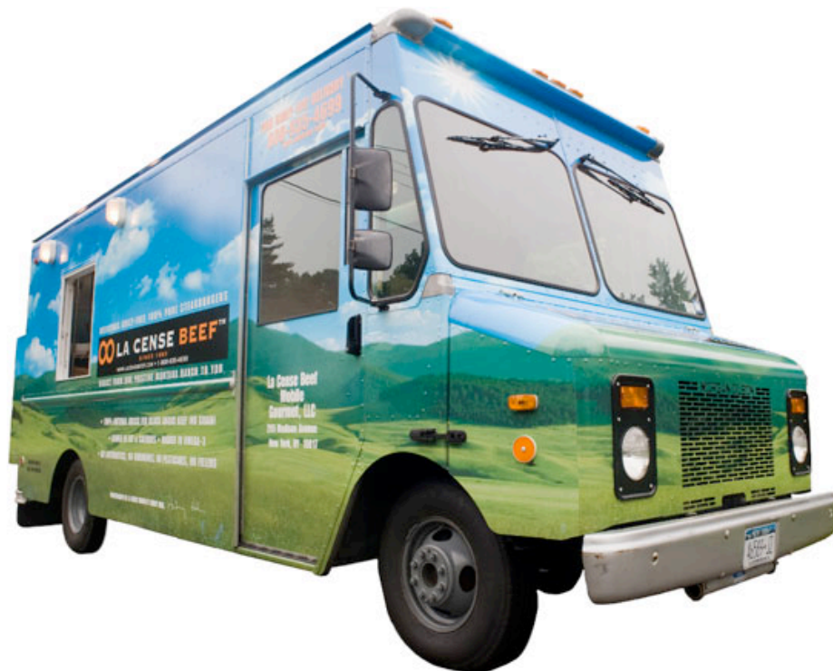
La Cense Beef's burger truck